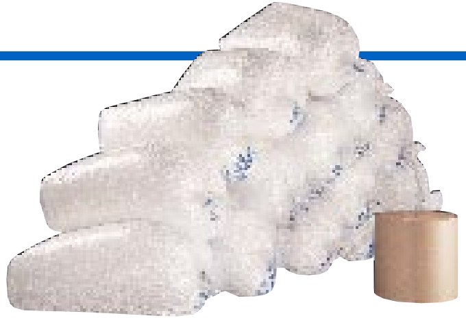
One roll of Void Kraft™ paper for the on-line system is the equivalent of up to twenty 14 cubic foot bags of loose fill.