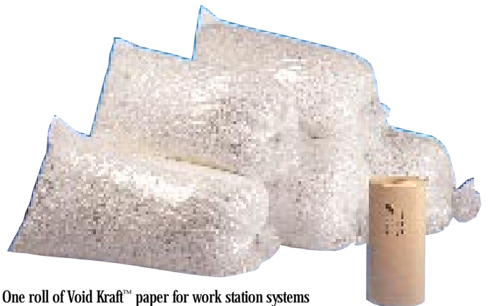
One roll of Void Kraft™ paper for work station systems is equivalent to five 14 cubic foot bags of loose fill.

This model is designed to sit on top of the packing table and dispense material into the carton.