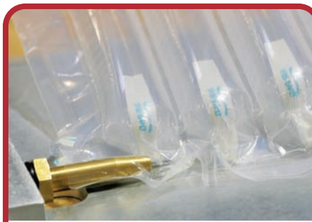
Inflates bag with accuracy and speed.

The AirSpeed™ 9000 Air-Paq™ product line's unique and patented design keeps a series of adjoining air tubes securely inflated to cushion and protect lightweight products during shipment. The tubes are connected via a series of patented one-way valves – in the unlikely event that one air chamber is punctured, the others remain inflated, protecting your goods.