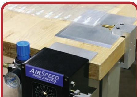
Clamps to any table surface