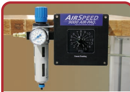
Automatically gauges pressure