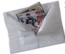
PriorityWrap™ Bubble Laminate

PriorityWrap™ Bubble Laminate provides strong, yet lightweight, protection. It is best for odd-shaped items or products in need of maximum cushioning and surface protection, like cosmetics, pharmaceuticals, CDs and DVDs.