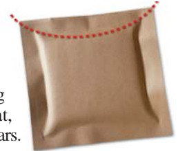
PriorityWrap™ Rigid Board

PriorityWrap™ Rigid Board utilizes our patented XRS Roller System creating a crescent seal that suspends the product, minimizing product shifting and providing additional corner protection. Ideal for flat, evenly shaped items, like books and calendars.