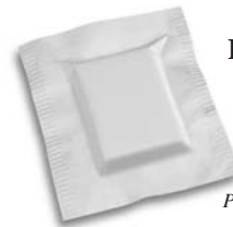
PriorityWrap™ Film/Paper Laminate

PriorityWrap™ Film/Paper Laminate provides a durable co-extruded film layer on the outside, and a tough kraft layer on the interior, making it perfect for lightweight products and soft goods.