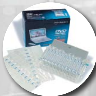
Same product, better pack.