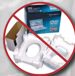
Larger package, multi-materials needed, more storage, more waste.