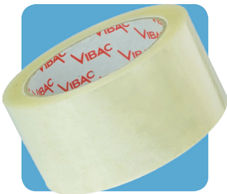
PACKAGING HOT MELT - ACRYLIC