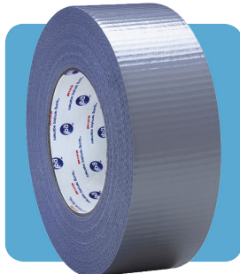
INDUSTRIAL ELECTRICAL - DUCT