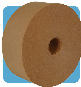
WATER ACTIVATED PAPER - REINFORCED